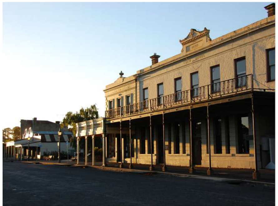
Fraser Street on a summer morning.