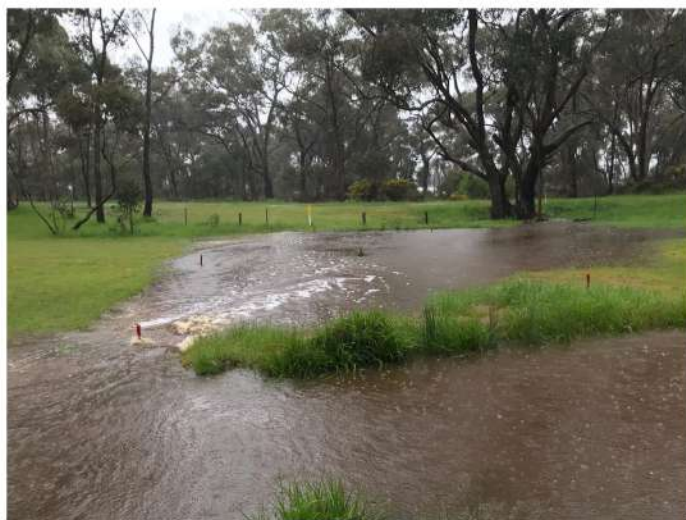
Course flooding, 13 October 2022.

The continuing wet weather has had a severe impact on most golf clubs in the Ballarat District, but at Clunes GC we have managed to maintain our regular competition and event schedule. The Thursday evening Chicken Run is off to a stuttering start, though. The course seems to have absorbed everything the weather can throw at it and is returning to a more familiar level of firmness, but with extra grass (and mosquitoes).